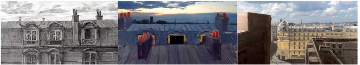
Research drawing and paintings - Outside the bedroom

An exhibition is also proposed to follow on from the short film and the show. Through sketches, preparatory drawings and scenery, etc. the audience takes a peak behind the scenes of these two creations while learning the techniques and processes used in animation. Some installations can be handled directly by the audience to create an animated picture. The exhibition can be held in theatres if there is enough space or in other venues such as a museum, exhibition hall or other unusual settings.