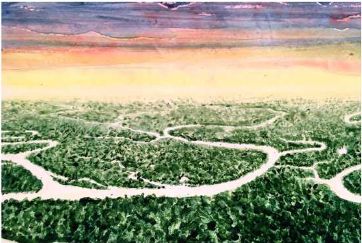
The Amazon - Painted revolving scenery