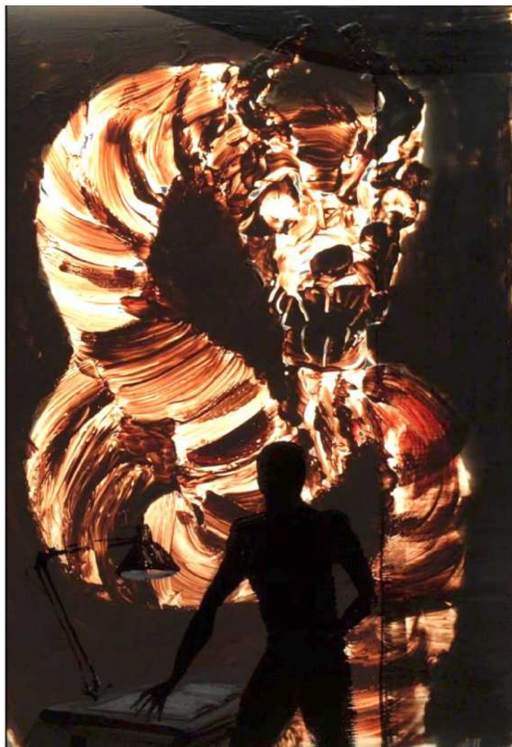
Research painting - appearance of a creature © Stereoptik