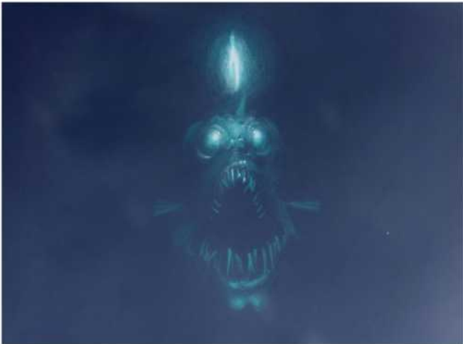
Deep-sea fish - Cartoon