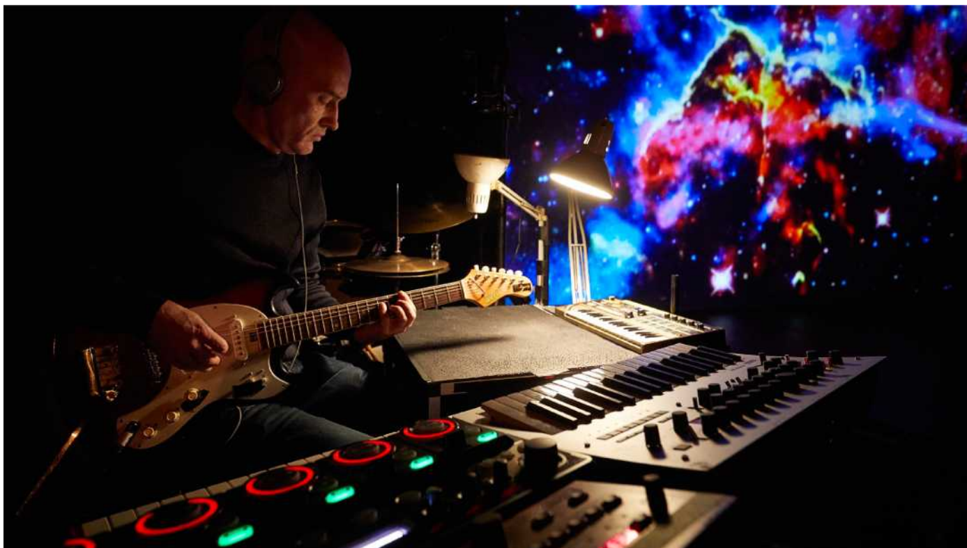
Extract from the show STELLAIRE