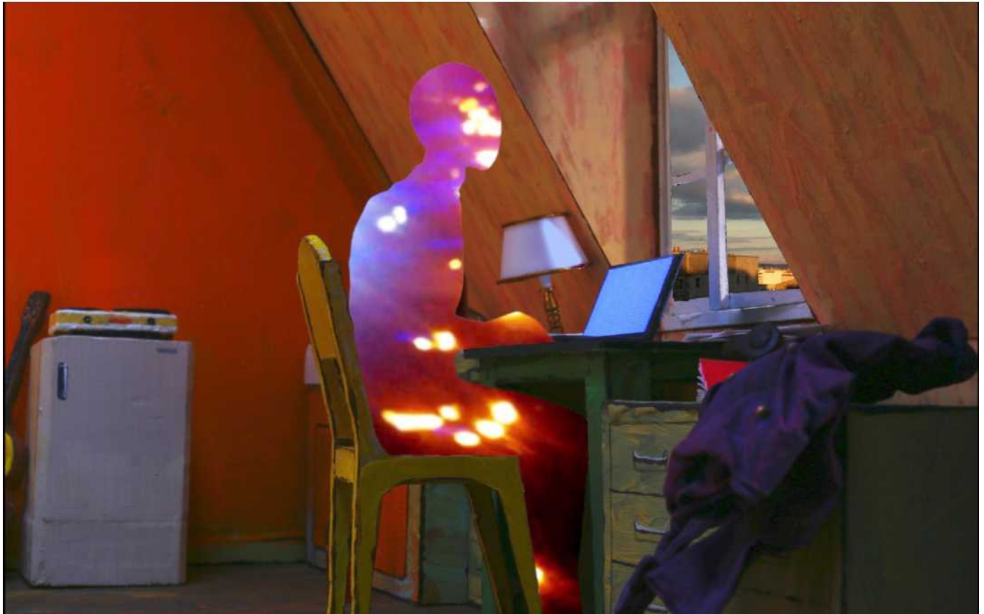
Inside the bedroom