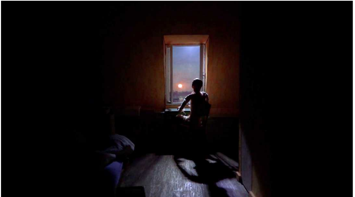
Inside the bedroom - Model

The exhibition supplements these first two proposals, by taking the audience behind the scenes to discover the research stages, the preparatory sketches, the storyboard and even installations made from overlays revealing the principles of frame-by-frame animation or how to create a movement from six or seven drawings.