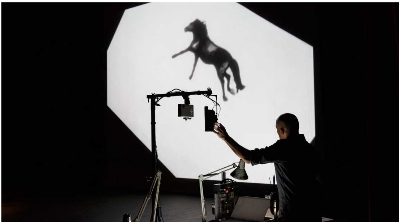
Extract from the show DARK CIRCUS