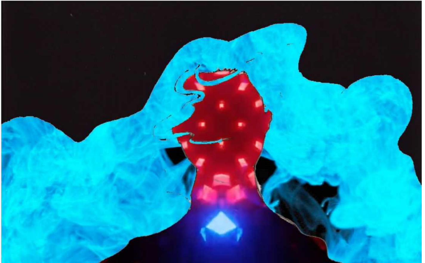
Chimerical creature - Drawing and overlay